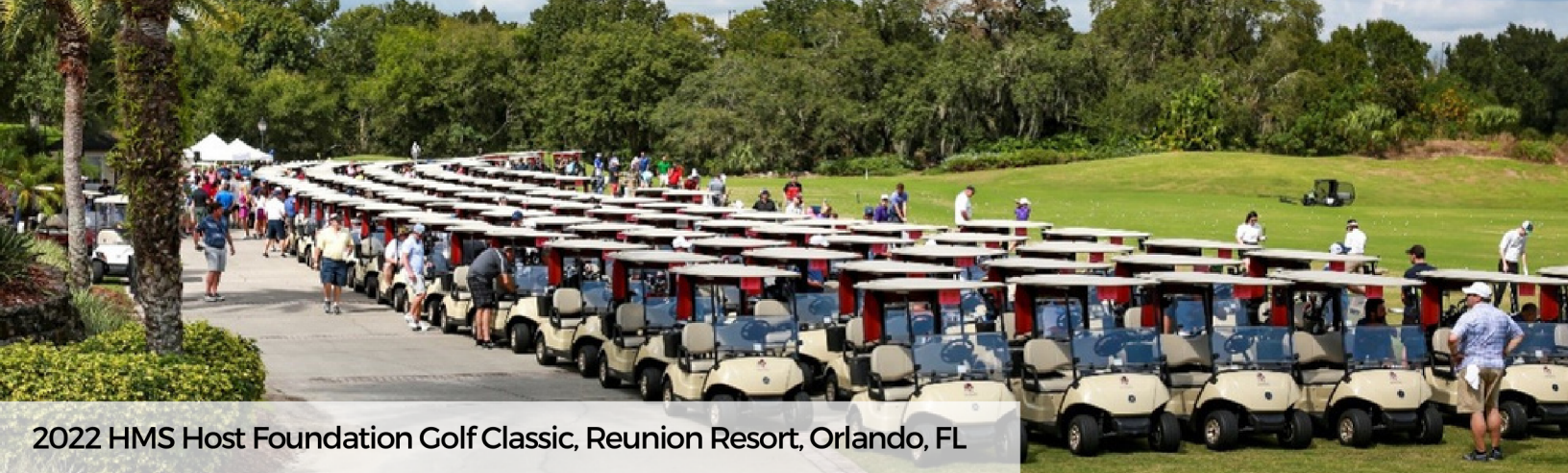
2022 HMS Host Foundation Golf Classic, Reunion Resort, Orlando, FL